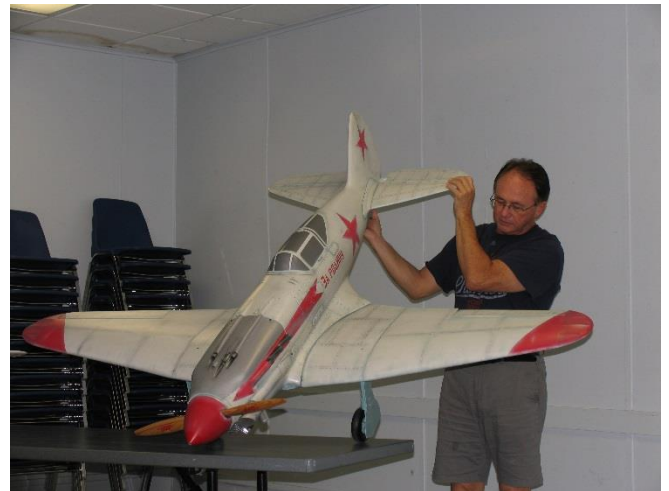
Now for the top side. Below he gives it a love tap