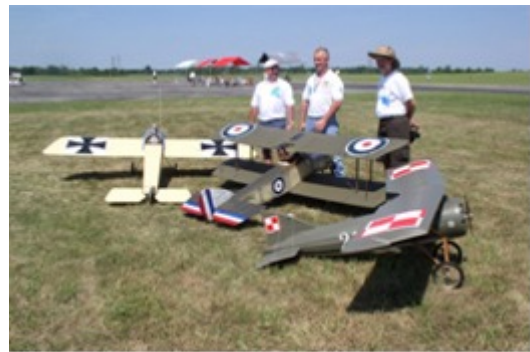
A gaggle of WWI planes. All these planes are 1/3 scale. Hummm, the Moraine looks small.