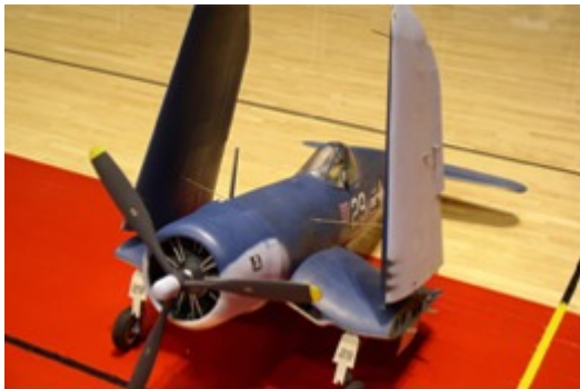
A Corsair with the wings folded and latched.

I thought I would include some photos of my trip to the NATS. It was an interesting time and I now have the competition bug,