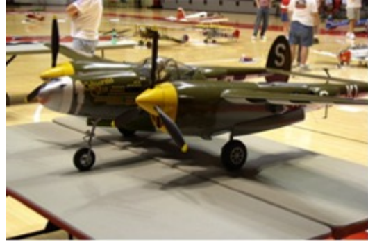
Dennis Crooks P-38 with counter rotating engines