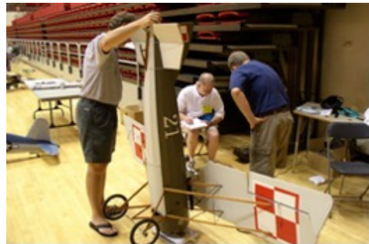
And myself weighing the Moraine Saulnier. I believed it weighed in at 20lbs.