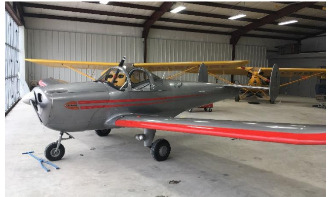
His girlfriends Eurocoupe