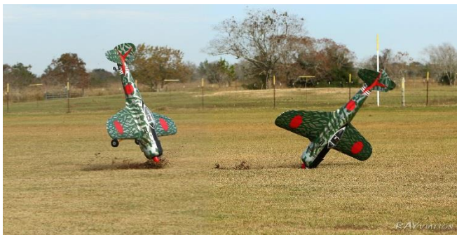
Super Dave and his ballet dance.