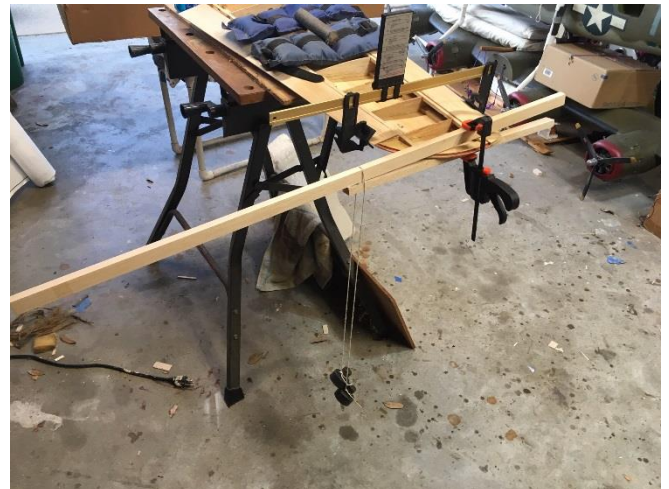
Some pics of my B-25 build. Measuring the wing to makes sure all incidents are the same. Had about 1 degree more on one wing tip. No problemsoak in Windex, clapped it and slid the weights up and down the stick until I got 1 degree. Bam, perfect wing.