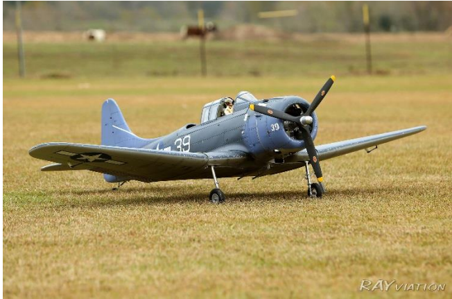
I don't remember whos plane this is but it was nice looking.